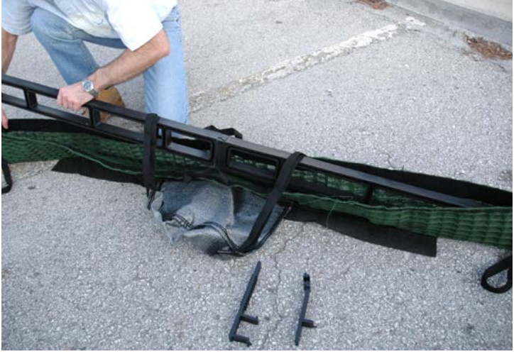
STEP 4: Slide assembled grids into outer sleeve.