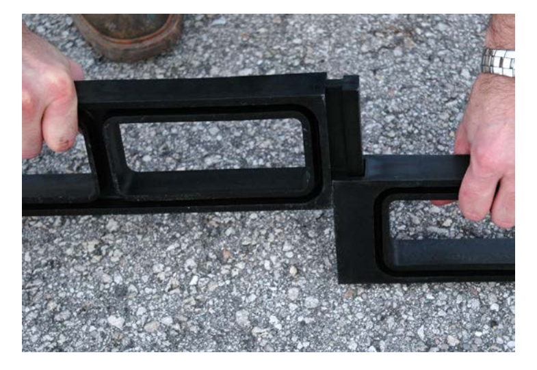
STEP 3: Slide grids together.