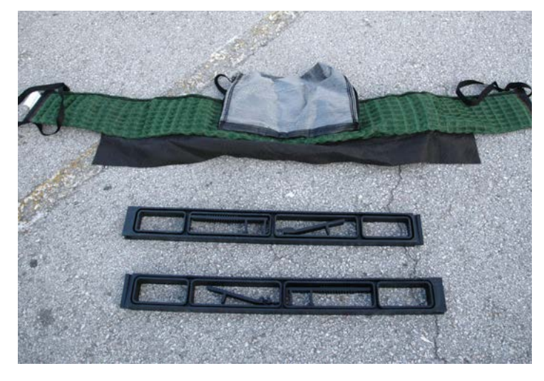
STEP 1: Remove GutterGuard Plus grids and sleeves from box (6-foot unit shown).