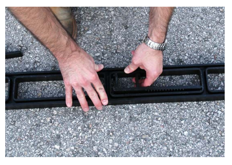
STEP 2: Snap off stabilizer arms (2-pieces per arm). Set aside for step 5.